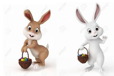
Easter Bonnet Competition